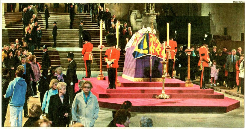
Last respects: a queue three miles long built up yesterday as an estimated 50,000 people waited to file past the coffin of the Queen Mother at Westminster Hall in London

THE QUEEN Mother once impersonated the comedian Ali G by clicking her fingers and offering her "respect" to the Queen, Princes William and Harry have revealed.